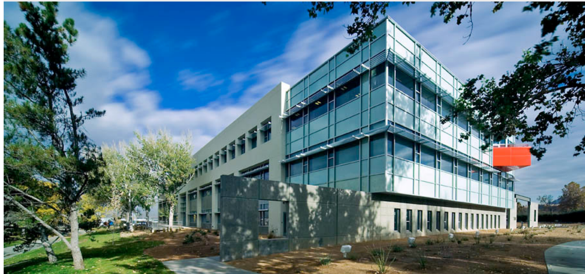
Jefferson Green, DPS's headquarters building – the first LEED Gold commercial building and the largest, most energy efficient LEED building in New Mexico at its opening

Source: EPA Greenhouse Gas Equivalencies Calculator