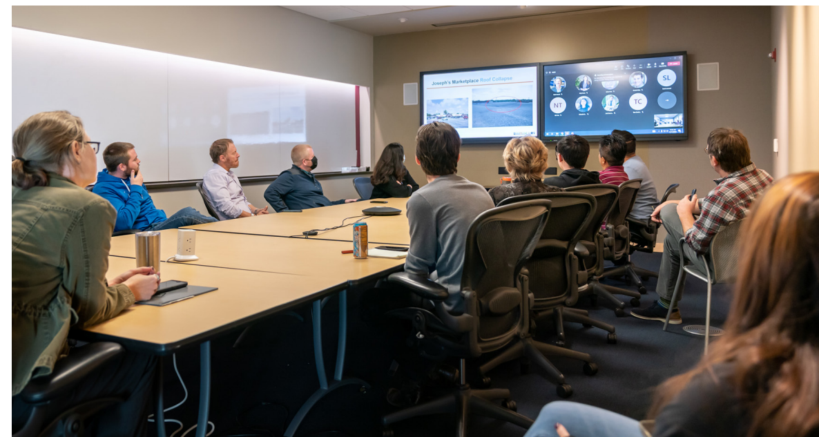
Friday Focus Presentation